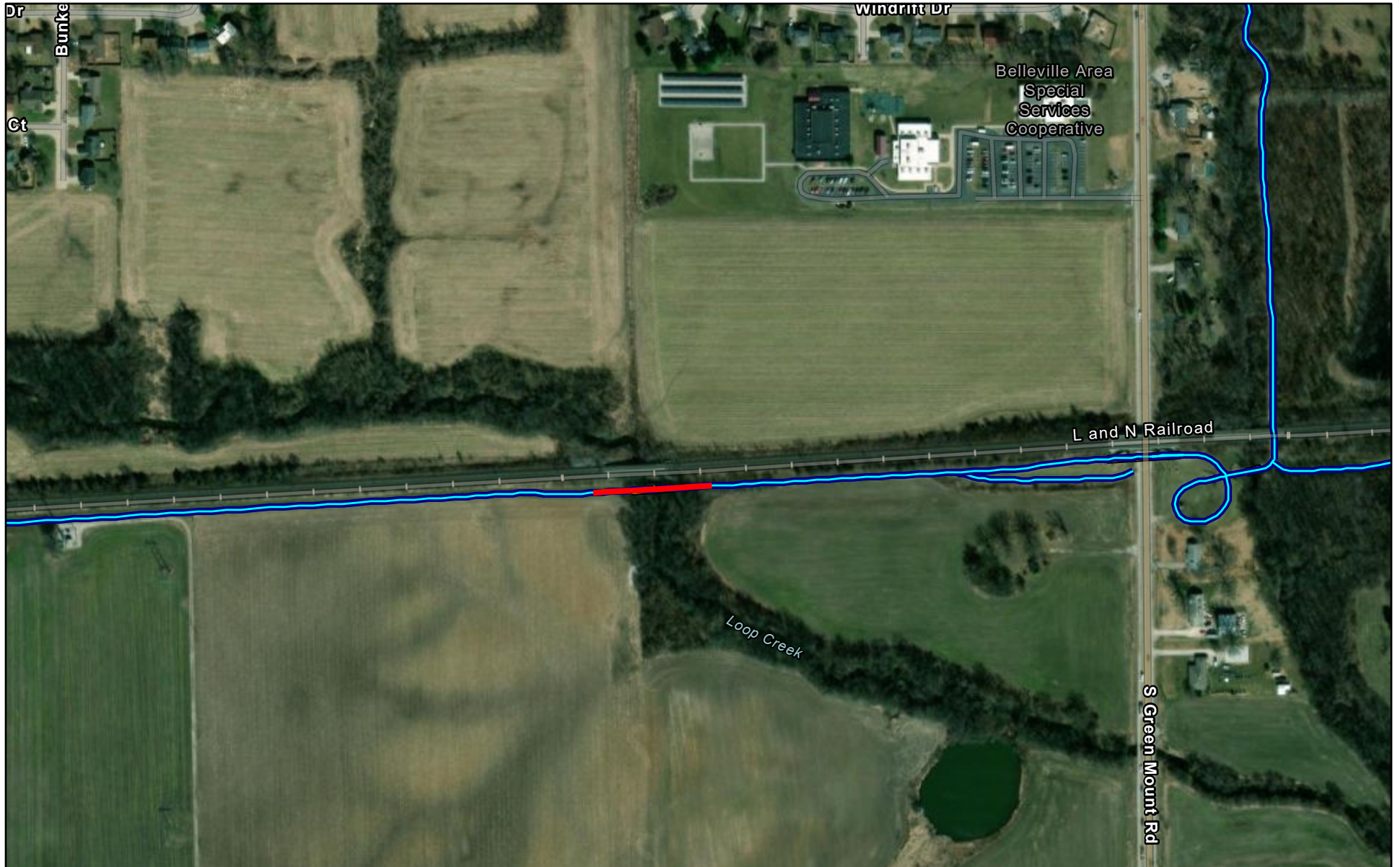
Exhibit C - Loop Crossing Trail Sealing